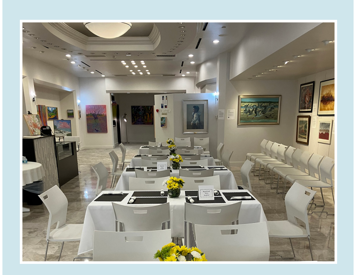
The Arts Advocates Gallery was beautifully set up for our February luncheon.